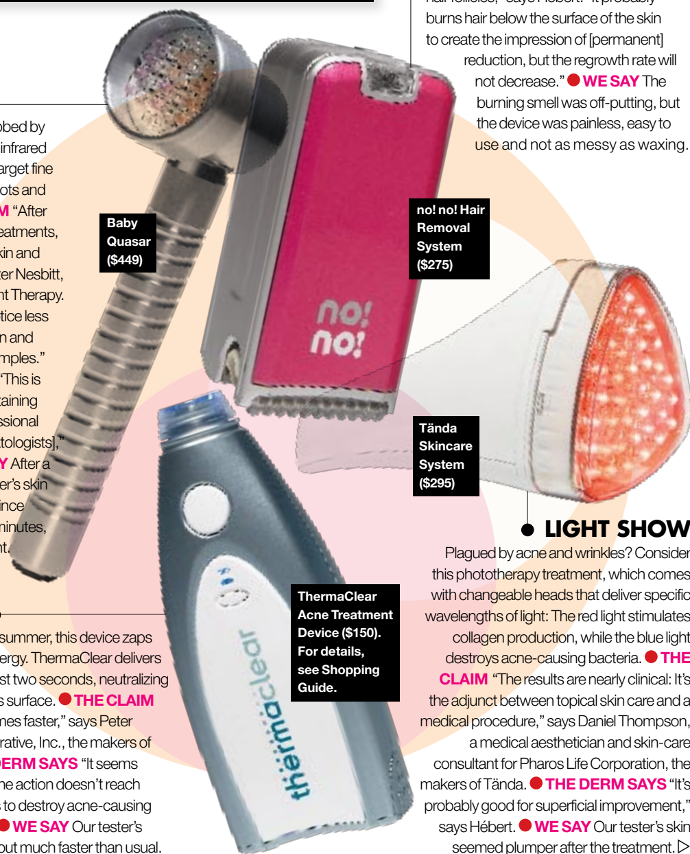
Baby Quasar ($449)