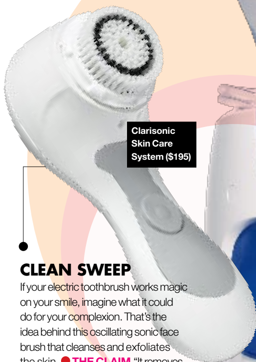
Clarisonic Skin Care System ($195)