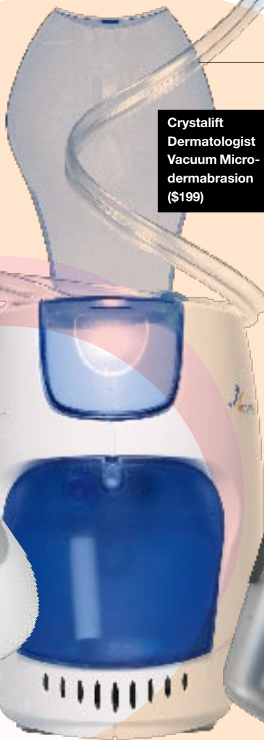
Crystalift Dermatologist Vacuum Micro-dermabrasion ($199)

Like professional micro-dermabrasion treatments, Crystalift vacuums away dead skin cells with exfoliating crystals. ● THE CLAIM "After the first treatment, you'll see improvement in skin tone and texture," says developer Jonathan David. "As weekly treatments continue, it minimizes pores and reduces the appearance of fine lines and age spots. The most dramatic results are typically seen in six to eight weeks." ● THE DERM SAYS "Micro-dermabrasion is a good way to cleanse the skin," says Hébert. ● WE SAY After using the gadget, our tester went out with friends; despite having a late night, she had clear skin the next day.